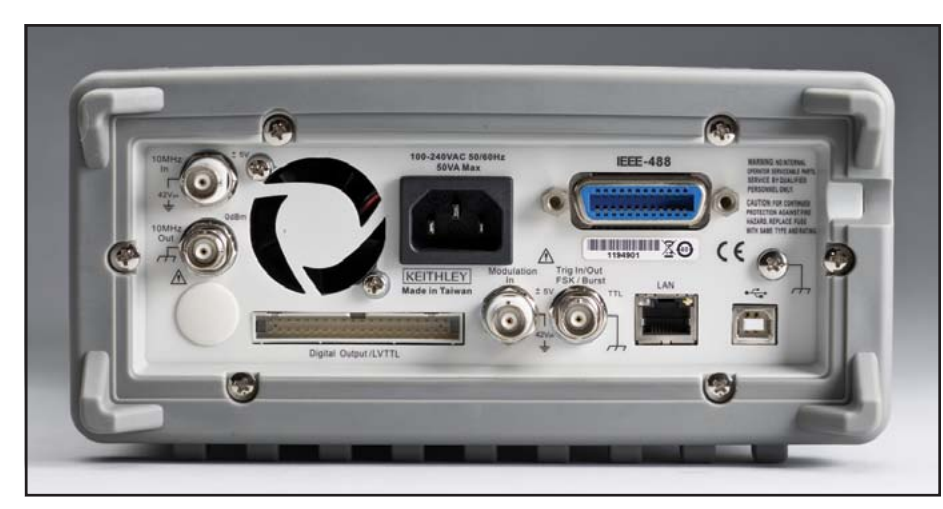
Model 3390 rear panel

The Model 3390 supports the physical, programmable, LAN, and Web portions of the emerging LAN eXtensions for Instrumentation (LXI) standard. The instrument can be monitored and controlled from any location on the LAN network via its LXI Web page.